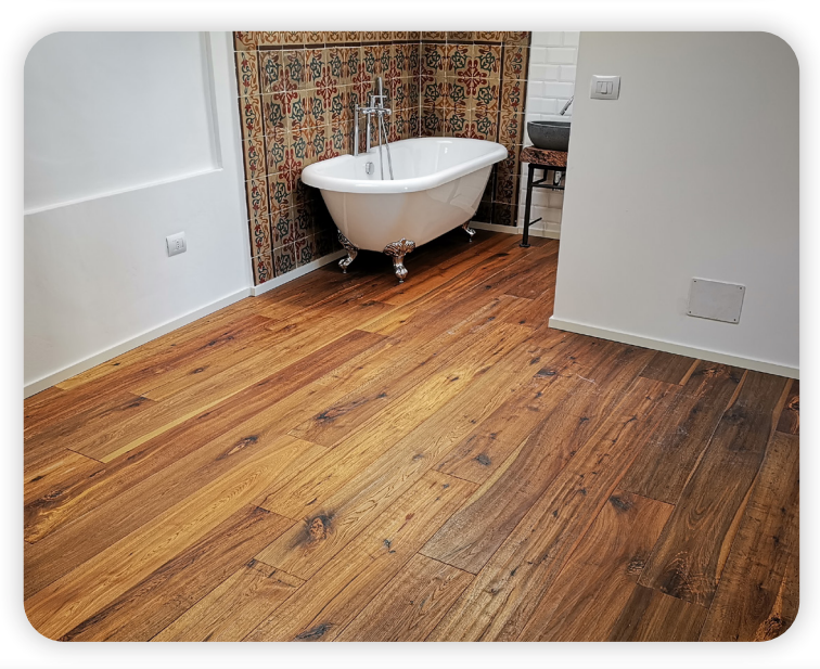
M0401-1 Rev. 4.0