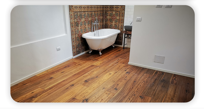
M0401-1 Rev. 04.0